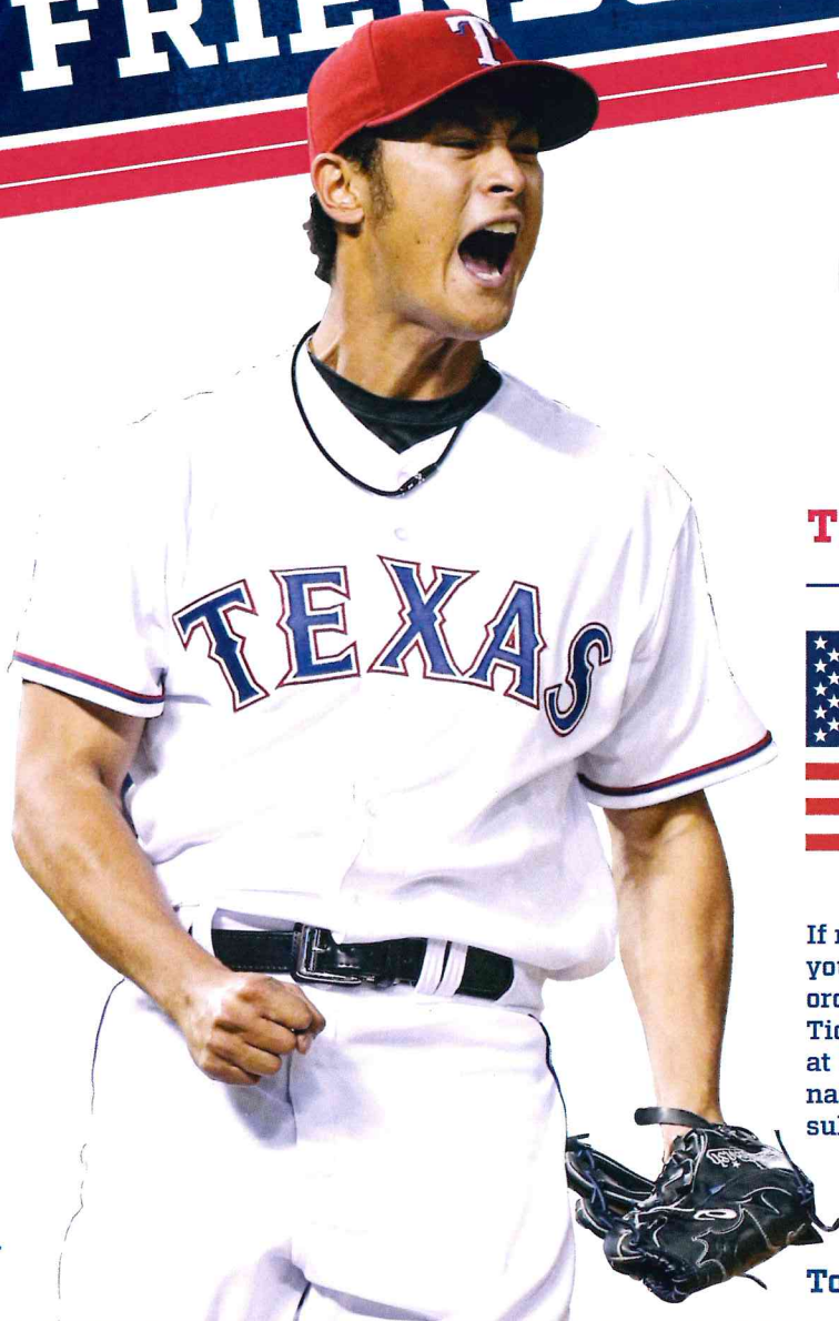
RHP | YU DARVISH